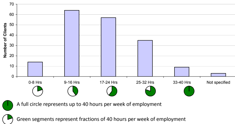
School Leaver Outcomes by Hours Worked per Week